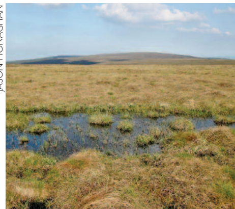
The wet plateau of Wolftrap Mountain.

Glenletter Valley. Listen for the bubbling calls of Curlews and possibly breeding Lapwing . Foraging Hen Harrier , Merlin and Peregrine may be seen here. Enjoy everything you see.